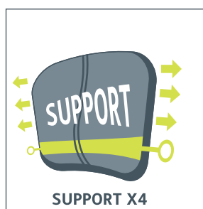
Adjust the lumbar profile with 4 internal straps provided