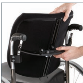
2. Drop in the backrest